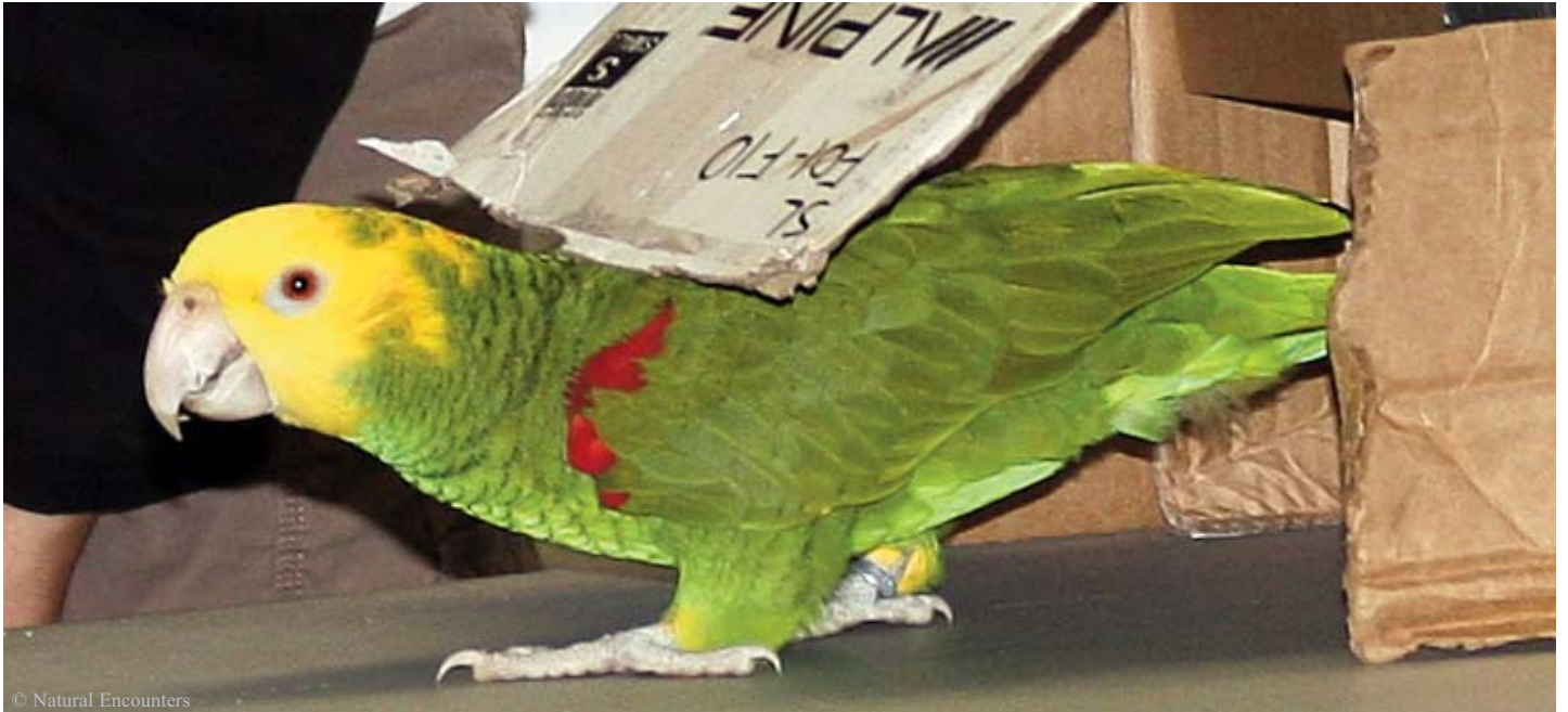
Animals like this Amazon parrot are empowered by exercising choice to solve problems and interact with novel items in their environments.

when practice is distributed over many short sessions rather than less frequent, long sessions. Therefore, positive practice doesn't need to be very time consuming. A few quick repetitions a day can build and maintain behavioral fluency. One positive side effect of this approach is the strong bond that develops between the teacher and learner due to the high rate of reinforcement associated with positive practice.