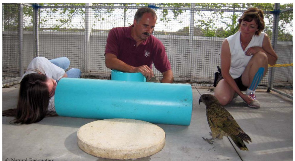
This Kea is first reinforced for approaching a new item (plastic tube) in his enclosure. Through successive approximations with reinforcement for each stage, he is taught to enter and walk through the tube in just a few training sessions.

We can empower companion animals to say no by ensuring that they have an escape route, a runway, to move away from imposing hands, and unfamiliar people and items, whenever possible. For instance, a 6" long T-perch used for training restricts a parrot's escape but a 36" long perch (with the caregiver at one end of the perch) allows the animal to express